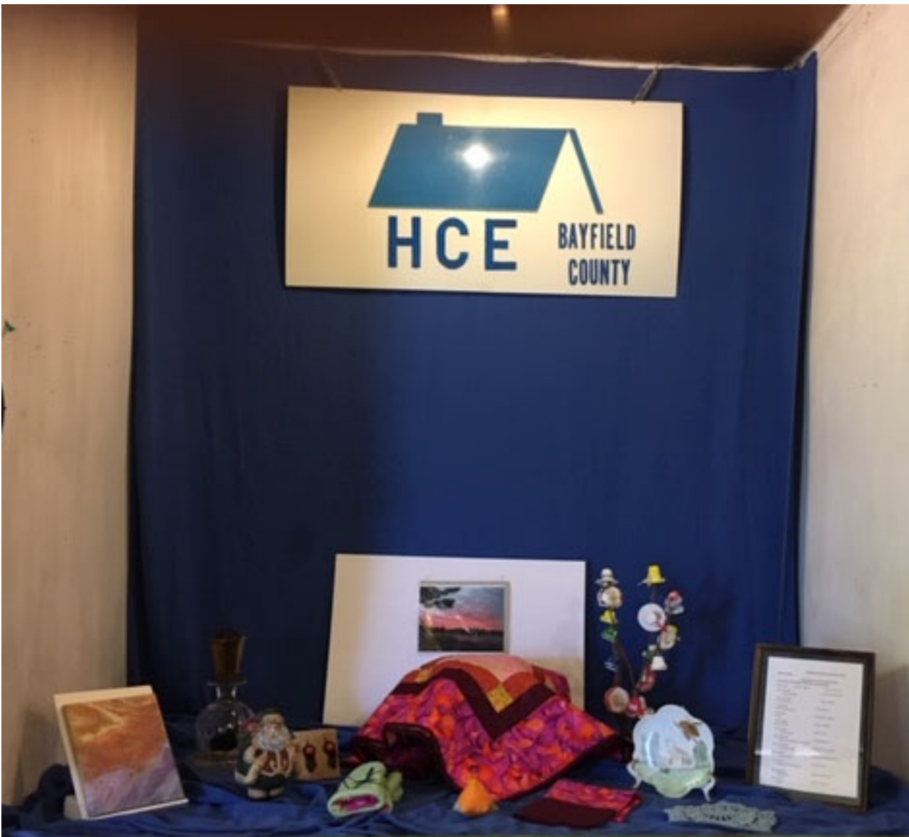
▲ Bayfield County HCE booth at the 2019 Bayfield County Fair. Displayed are the entries that are going to the HCE conference for state competition .