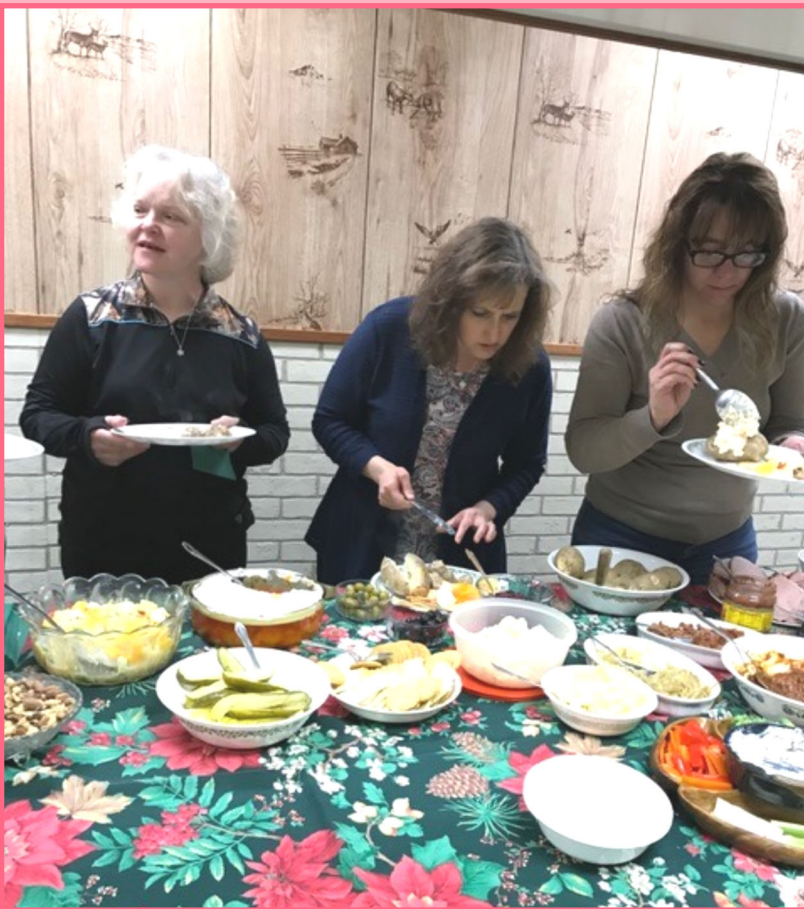
White River HCE Christmas party, Good food. & Good friends.