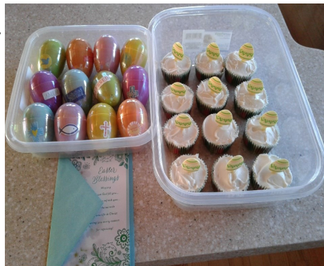
Left Odds 'N' Ends club made Easter Eggs, Carrot Cupcakes and a card for Shady Knoll to help residents celebrate Easter.