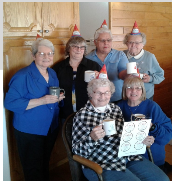
Mug Cake lesson and Birthday month.