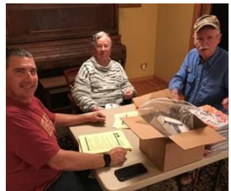
Putting the bookplates and activity sheets in the books.