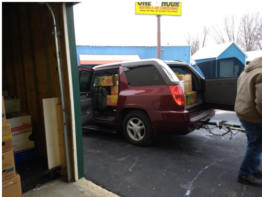
(Above) Loading up at De Pere Christen Outreach