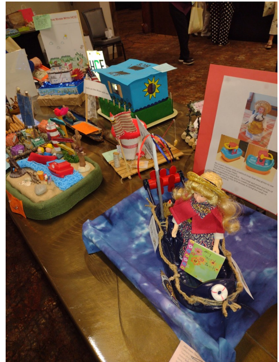
Bonus category "Decorate an object that Floats on the water"