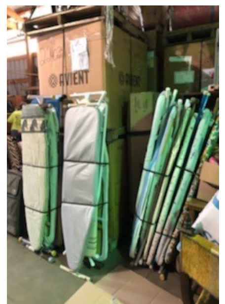
Ironing boards strapped ready for the totes.