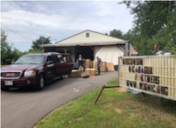
Erv and other volunteers unpacking the donations at Warehouse in Stevens Point.