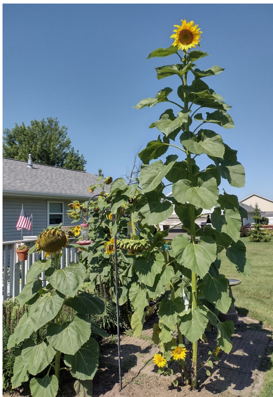
This sunflower grew from a seed from our bird feeder. Over 10 ft tall.

Closed-Extension Brown County Office Holiday