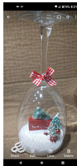
Waterless Holiday Snow Globe The cost is: $5.00

If you are doing the Waterless Holiday Snow Globe, you will need to bring your own glass container. Wine glass, jelly jar, canning jar, etc..