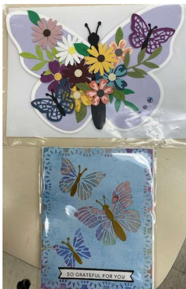
Greeting Card The cost is: $4.00