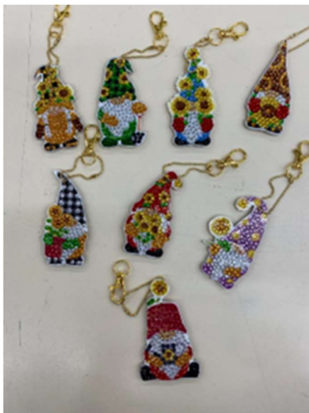
Diamond Dot Gnome Key Chain The cost is: $3.00

There will be three craft classes offered.