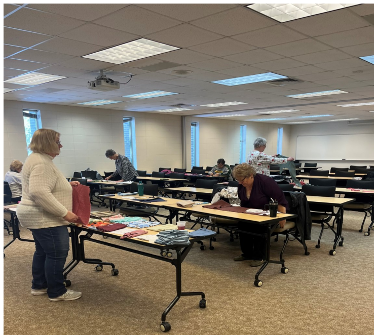
February 19th Stiches of Love Workshop